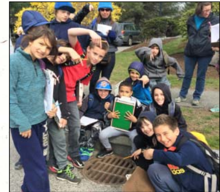
CCS&WCD, Maine Youth YardScaping unit