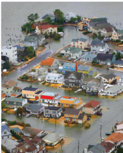
Flooding on the bay side of Seaside, New Jersey, was extensive after Hurricane Sandy made landfall. The unprecedented storm surge prompted the National Oceanic and Atmospheric Administration to increase the number of storm surge forecasters at the National Hurricane Center beginning with the 2013 Atlantic hurricane season.

Summit participants focused on the creation of a shared framework for resilient flood risk management that requires a systems approach that targets the hazard and facilitates the consideration of all aspects of reducing risk and balancing resources and then communicates the risk to the stakeholders. Formulating a vision of future flood risk management requires clear and appropriate policies, as well as guidelines and standards that