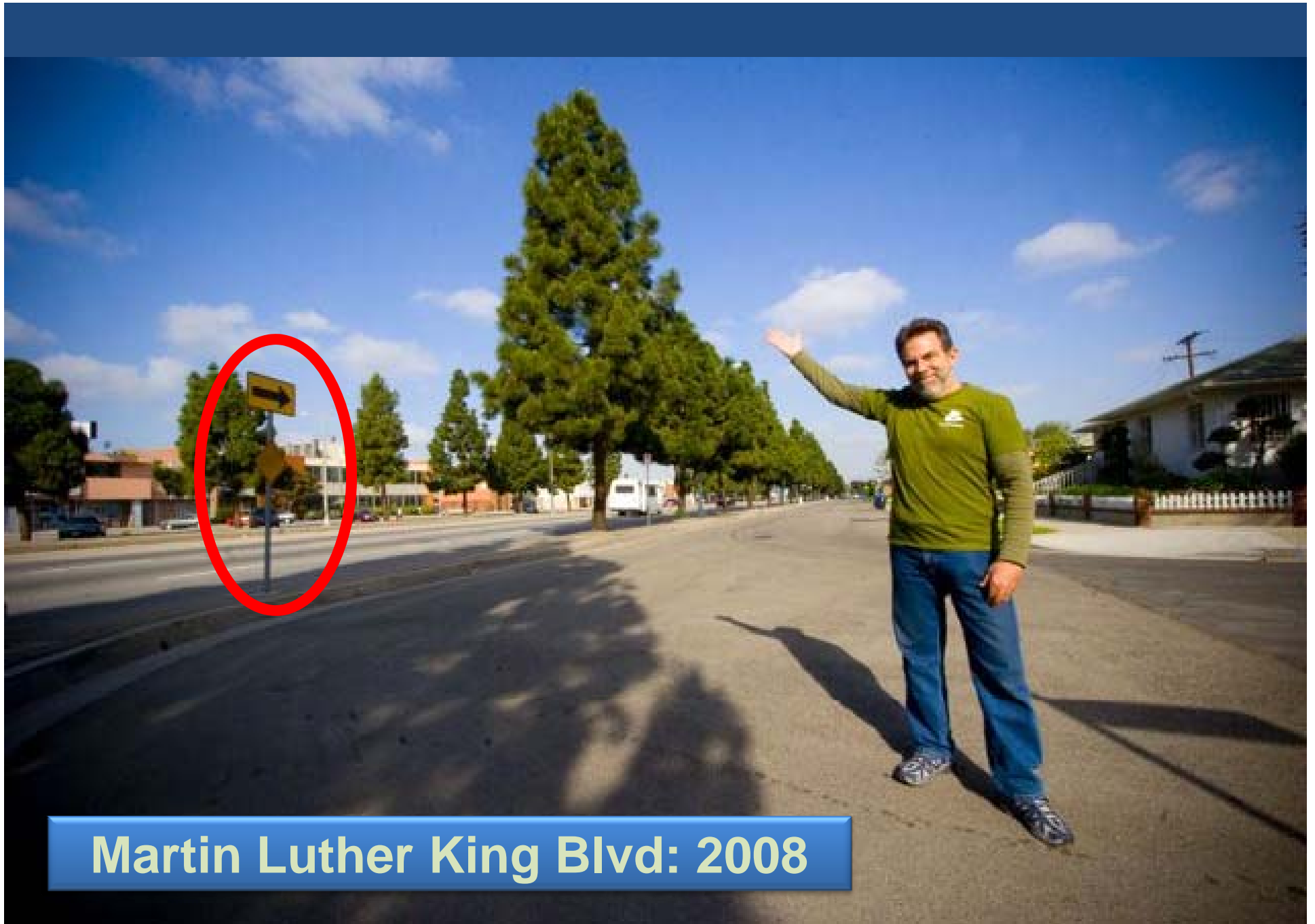
Martin Luther King Blvd: 2008