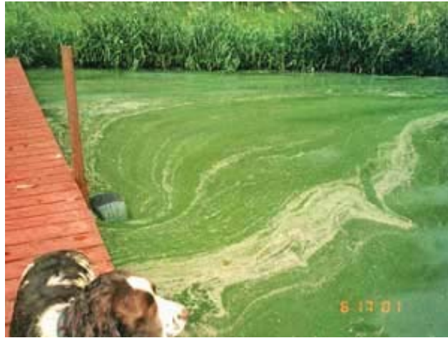
Figure 4. Dog near blue-green algae infested water.