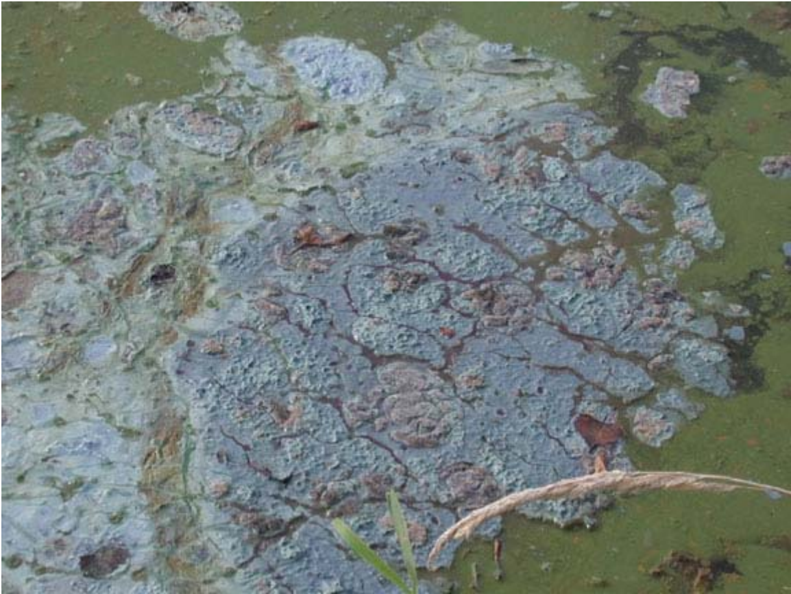
Figure 8. Photo of Lake Crystal, Minnesota.