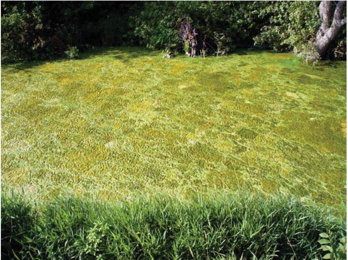
Figure 7. Algae Bloom (Minnesota Pollution Control Agency).

The following photos illustrate the aesthetic impact on waters within the Mississippi River Basin states: