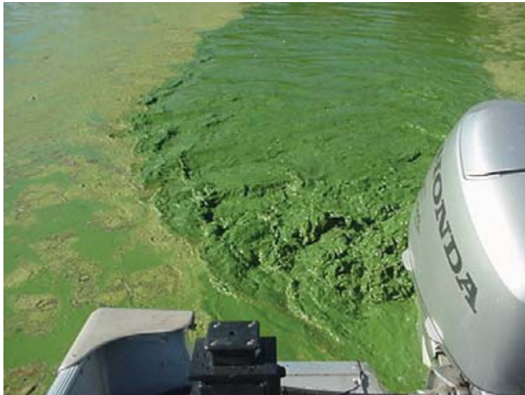
Figure 9. Algae, Wisconsin Department of Natural Resources.