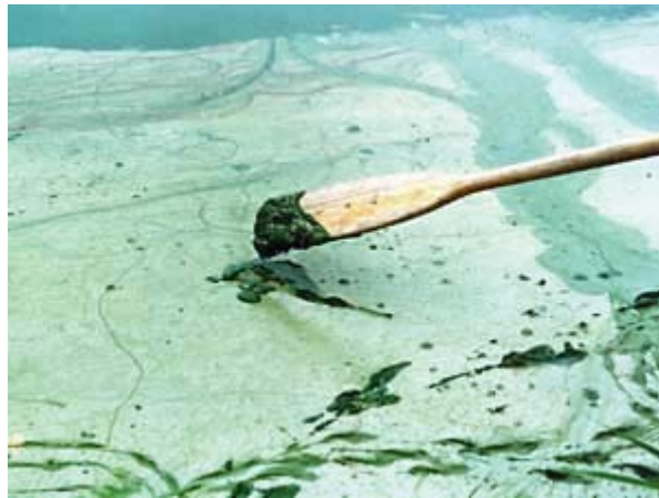
Figure 5. Blue-green algae.