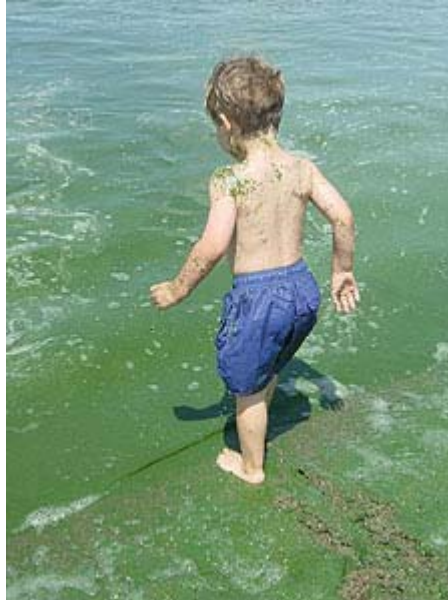
Figure 3. Boy swimming in blue-green algae, Lake Byllesby, Minnesota.

water rescue, military, construction, and maintenance personnel. 38 However, despite the health threats, resource management agencies often do not conduct any routine monitoring for blue-green algae or blue-green algal toxins. 39