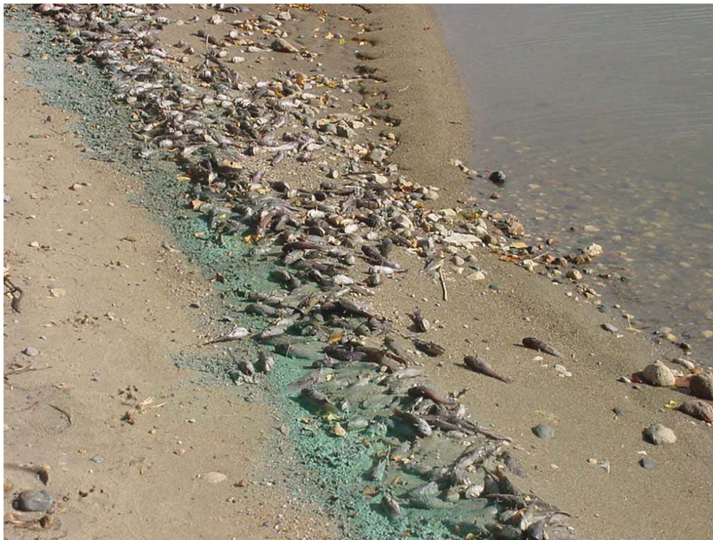
Figure 6. Photo of Lake Benton (Minnesota) Fish Kill, September 27, 2004.

A large fish kill on Lake Benton, in Lincoln County, Minnesota was caused by excessive algal growth. 81