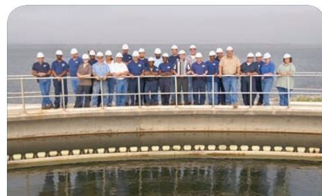
⚡ The Hampton Roads Sanitation District, Va., has received Platinum Award recognition for the past 22 years.

To learn more about the eligibility requirements for this award program and to download and application, please visit the NACWA website at www.nacwa.org/peakperformance . ♦