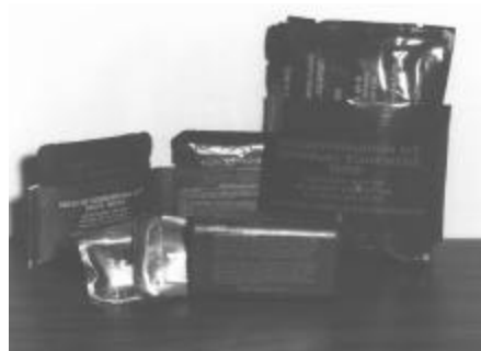
Figure 3-4. Decontamination Kit, Individual Equipment: M295

A reactive sorbent first adsorbs the CB contaminate and then chemically detoxifies it. Reactive sorbents have been prepared by soaking simple sorbents in alkaline solutions, effectively “loading” the matrix with caustic material. Once sorbed into the sorbent matrix, the agent encounters the alkaline medium, reacts with it, and is destroyed. A second approach for reactive sorbents is to prepare a polymeric material with reactive groups attached to the polymeric backbone. In this case, the agent is sorbed by the polymeric matrix, encounters the reactive group, and is neutralized by it. A third approach is to use microcrystalline metal oxides such as aluminum oxide or magnesium oxide. An example of decontamination equipment utilizing reactive sorbents is the Decontamination Kit, Individual Equipment: M295, manufactured by Truetech (fig. 3-4).