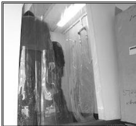
Figure 2. Section 1, entrance

The unit is divided into four sections. Smoked-out plastic curtains divide each section including the entrance and exit to provide privacy. The first section is the entrance, shown in figure 2. The entrance is utilized as a storage area for the water heater, when the unit is not in use as a clothing removal area.