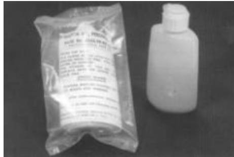
Figure 3-1. Decontamination Kit, Personal No. 2, Mark 1