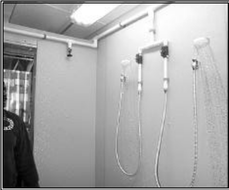
Figure 3. Section 2, primary showers

Sections 2 and 3 house the showers. Section 2 houses the primary showers. Four showerheads are located in this section for decontamination purposes (fig. 3). Section 3 includes 2 showerheads, one on each wall (fig. 4).