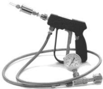
Figure 3-2. K1-05 standard unit