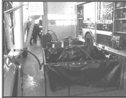
Figure 8. Holding tank

The department is currently in the process of working on revisions to their design to ensure optimal trailer levels in the future. The Boston Fire Department built the decon unit using the knowledge they have acquired during working hazardous materials incidents. However, there are many commercial decontamination trailer vendors available. Below are the names and contact information for some of them.