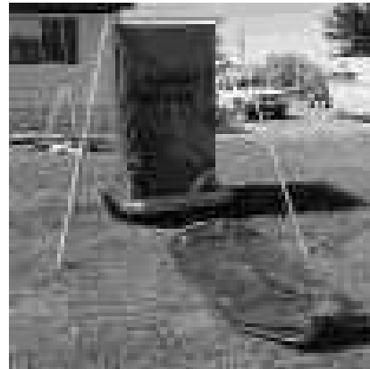
Figure 3–13. SC spill containment single decon unit with bladder