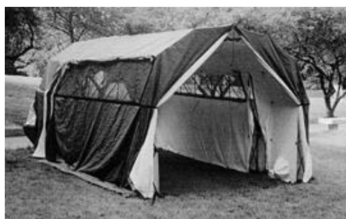
Figure 3–11. TVI Quick-E WMD command post

Portable decontamination shower units keep water contained by patented recovery bladders connected to a catch basin while the victims stand on a stool above the contaminated water. The units are available as single, double, or quad units. Examples of decontamination units are the