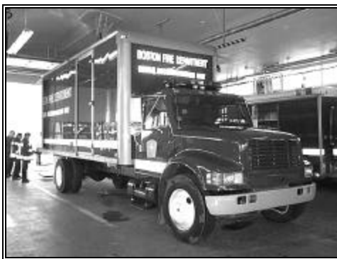
Figure 1. Mobile decontamination unit

The Boston Fire Department recently completed the construction of a new Mobile decontamination unit, shown in figure 1. This unit is a 22 ft International box truck that has been outfitted to function as a decontamination unit, responding to hazardous materials incidents. The unit provides 6 indoor showers and 4 outdoor showers using warm water and a sheltered area for changing to address modesty issues. It has been outfitted with polyethylene walls, floor and ceiling, plumbing, electrical, ventilation equipment, supplied air, and a hot water system. In preliminary testing by the Boston Fire Department it was found that it would take a civilian 6 min to 7 min to move through the decontamination sections and 5 min to 7 min for a firefighter dressed in level A. The decontamination unit also carries military field shower units and emergency decontamination shelters. The showers in the units are capable of supplying warm water for decontamination. The water heater used for the field shower is capable of delivering 33000 British thermal unit (Btu).