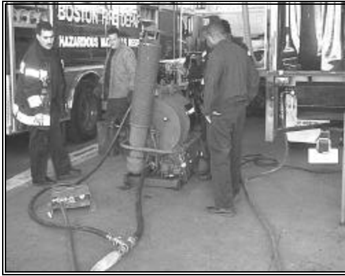
Figure 7. Generator

The entire system must be pressurized to no more than 40 lb psi. As a result, a fire engine is utilized as a manifold to regulate the pressure from any water source (i.e., hydrant). Liquid runoff and waste runs via gravity feed through drains that are located in the floor of every section into a collapsible holding tank (fig. 8). A hazardous materials contractor then removes the contaminated water from the container.