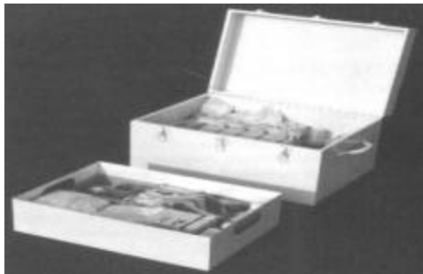
Figure 3–7. NBC-DEWDECON-PERS Emergency Response Personnel Decontamination Kit

For general decontamination information the reader can refer to Responding to A Biological or Chemical Threat: A Practical Guide (see app. B). For information on methods and techniques utilized during mass casualty decontamination, the reader should refer to Guidelines for Mass Casualty Decontamination During a Terrorist Chemical Agent Incident (see app. B).