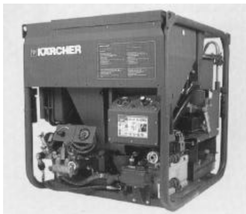
Figure 3–9. Karcher C8–DADS direct application decontamination system

decontamination system (shown in fig. 3–9). This system uses both physical (removes contaminate) and chemical (neutralizes contaminant) decontamination processes.