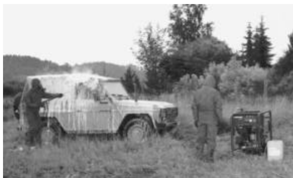
Figure 3–8. Karcher MPDS multipurpose decontamination system

Equipment decontamination refers to the ability to decontaminate CB agent or TIMs from the exterior surfaces of equipment. This includes the decontamination of both large (e.g., vehicles) and small items (e.g., computers, communications equipment). An example of this type of equipment is the Karcher MPDS multipurpose decontamination system (shown in fig. 3–8). The MPDS is equipped with a high-pressure spray system and depending on the decontaminant that was used, either chemical or mechanical technologies are employed.