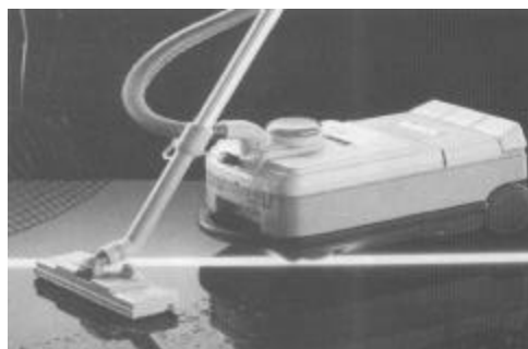
Figure 3–6. Karcher AEDA1 decontamination equipment