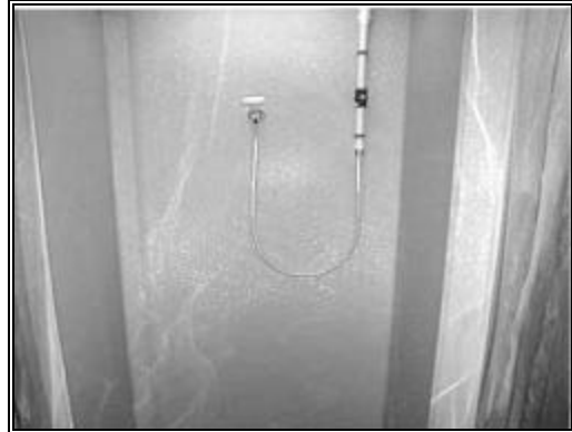
Figure 4. Section 3, secondary showers

Finally, section 4 comprises a storage and redressing area and is used to store victim clothing, storage shelving, decontamination supplies and solutions, supplied air, and extra tentage (fig. 5). Section 4 also includes a ventilation system that draws air from all four sections through a HEPA filter and vents to the outside (fig. 6).