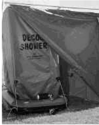
Figure 3–12. SC spill containment single shower stall with dressing room

SC spill containment single shower stall with dressing room (fig. 3–12) and the SC spill containment single decon unit with bladder (fig. 3–13). Appendix C contains a listing of commercially available decontamination shelters.