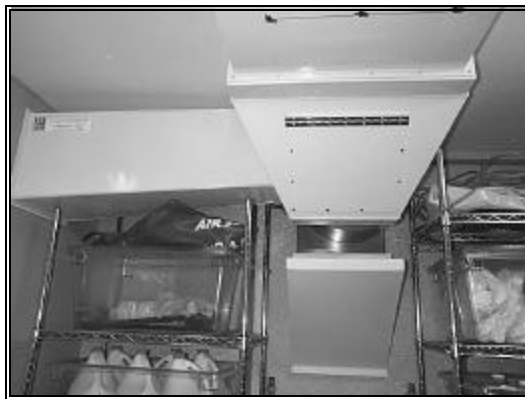
Figure 5. Section 4, storage area

Finally, section 4 comprises a storage and redressing area and is used to store victim clothing, storage shelving, decontamination supplies and solutions, supplied air, and extra tentage (fig. 5). Section 4 also includes a ventilation system that draws air from all four sections through a HEPA filter and vents to the outside (fig. 6).