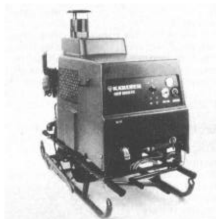
Figure 3-3. Karcher HDS 1200 EK high-pressure steam jet cleaner unit