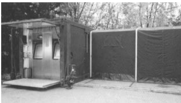
Figure 3–5. Karcher mobile field laundry CFL 60

Thermal processes remove CB contaminants through vaporization. It should be noted that another means of decontamination is necessary for agent detoxification. Examples of decontamination equipment utilizing a thermal process are the Karcher mobile field laundry CFL 60 (fig. 3–5) that both physically and thermally removes decontaminates, and the Karcher AEDA1 decontamination equipment (fig. 3–6) that employs a combination of low-temperature thermal technology and mechanical technology.