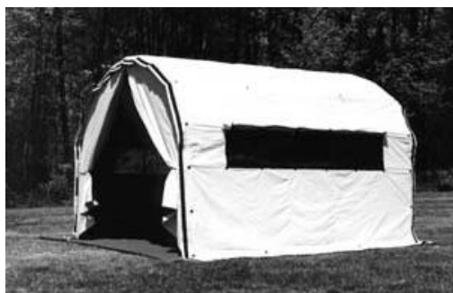
Figure 3–10. TVI first response shelter

This guide primarily focuses on decontamination equipment used for removing and/or neutralizing CB contamination from personnel (to include clothing), equipment, and infrastructure. However, emergency first responders should be aware that there is equipment used to support CB decontamination operations. Decontamination shelters and decontamination units (shower/dressing rooms with basins and bladders) are examples of equipment used to support decontamination operations. Decontamination shelters are used to provide protection to personnel (victims, technicians, etc.), subsequent to decontamination operations, from any remaining CB contamination. Examples of decontamination shelters are the TVI first response shelter (fig. 3–10) and the TVI Quick-E WMD command post (fig. 3–11).