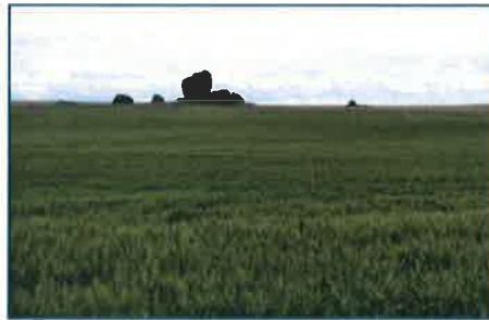
Fig 3. Biosolids-grown wheat on dryland fields of Boulder Park.

knowledge about these results has spread among eastern Washington agricultural communities, BPI has received requests for biosolids from farmers in Grant and Adams counties. The state biosolids program and its primacy over local ordinances provide a consistent regulatory climate for BPI. A return to county-by-county regulations would affect BPI's ability to provide biosolids and application services to farmers who need biosolids to improve their soils.