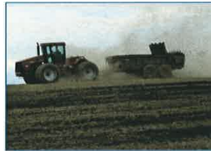
Fig. 4. Applying an agronomic rate the of biosolids on a fallow wheat field at Boulder Park.