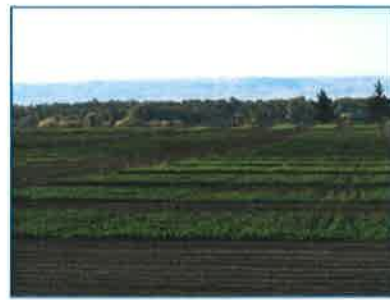
Fig. 2. Research plots at NSF for evaluation of various rates of biosolids and varieties of canola.