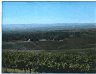
Fig. 1. NSF farmland, grapes in foreground, hops in background.