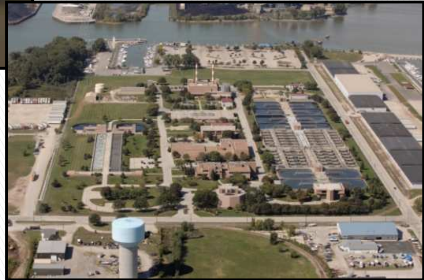
Green Bay Facility