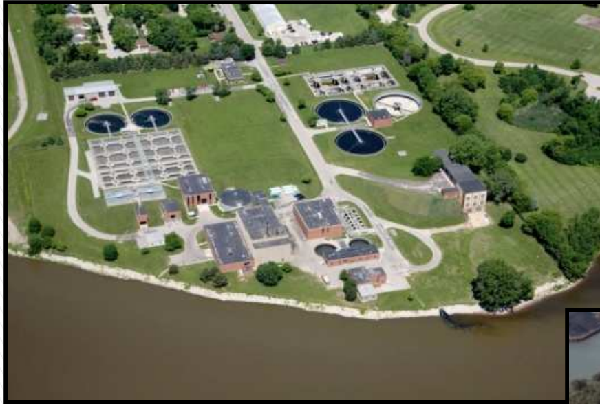
De Pere Facility